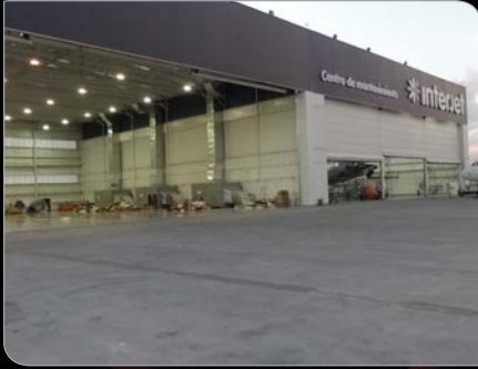
Toluca International Airport Maintenance & Repair Center