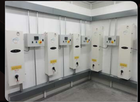
Explosion-Proof Control Room