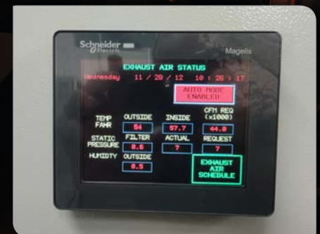
Control Interface Panel