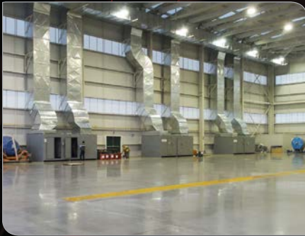
Filtered Air Supply Units