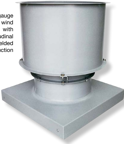
Model 53 Roof Ventilator shown with stack cap

14 gauge flanged wind band with longitudinal seam welded construction